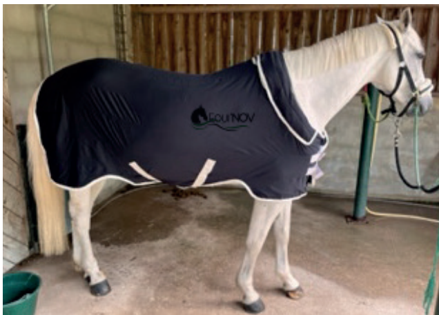
Magnetic blanket (323,38€ HT / 388€ TTC)