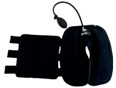
Hock (198,33€ HT / 238€ TTC)