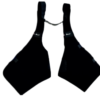
Stifle (206,67€ HT / 248€ TTC)